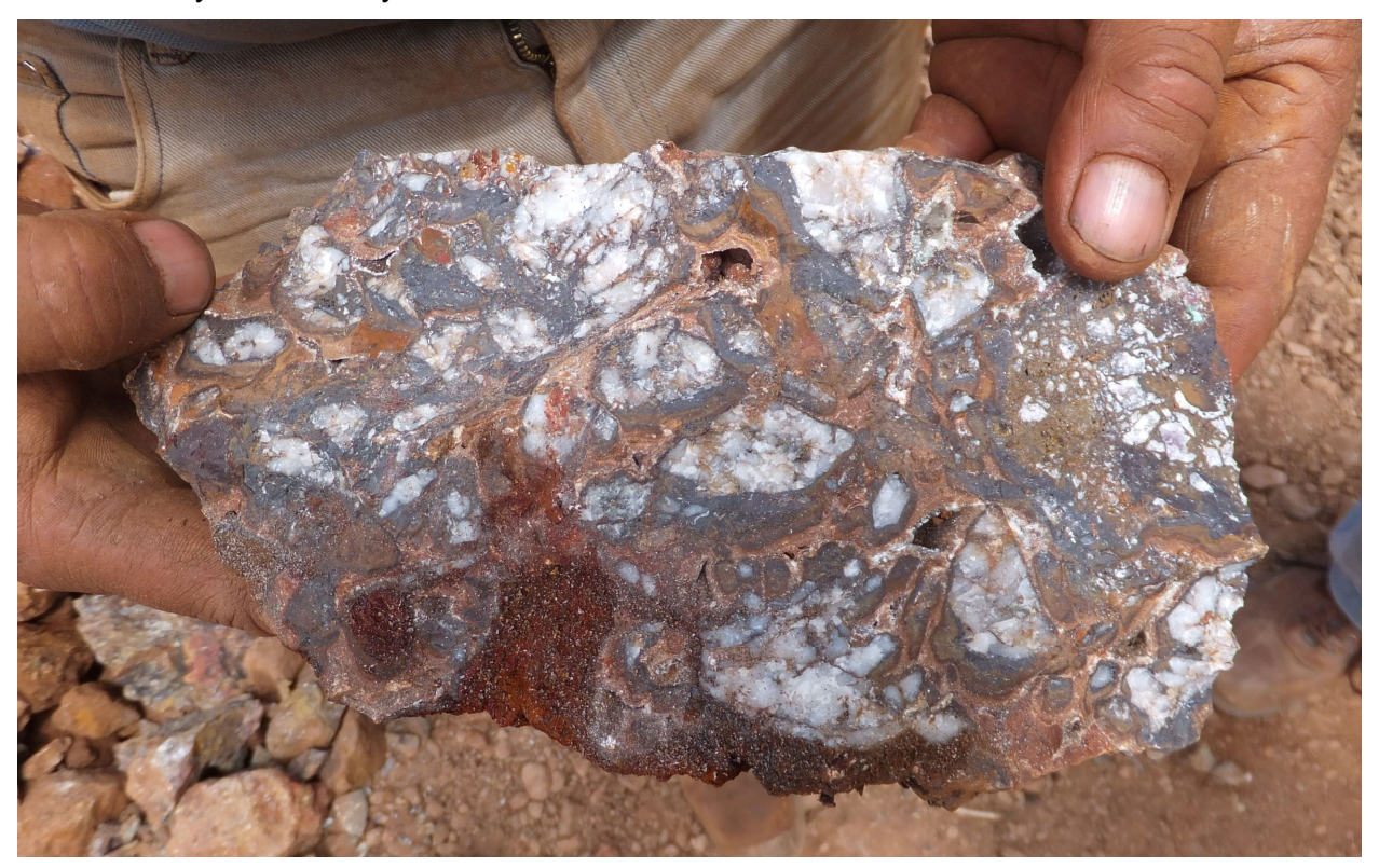
Figure 1: Brecciated vein from Level 7 of artisanal workings

This active 2025 work program will continue work delineating the vast vein system on Carrizal property and aid in refining future drill targets. All samples will be sent for assay and the Company expects a steady stream of assay results shortly.